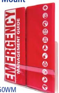
Item # MP5050WM