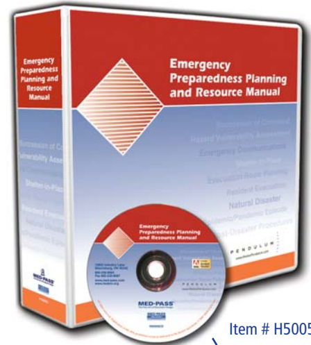
Item # H50050

Visit med-pass.com to view a detailed Table of Contents, keyword: H50050