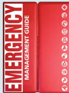
Item # MP5050GD

The Emergency Management Guide is a handy quick reference to use during emergency situations that could affect a facility. The guide gives a facility at-a-glance reminders and instructions for emergencies ranging from severe weather to workplace violence to missing residents. The guide has an area for facility-specific contact information to be added.