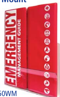
Item # MP5050WM