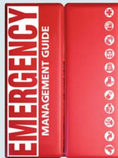
Item # MP5050GD

The Emergency Management Guide is a handy quick reference to use during emergency situations that could affect a facility. The guide gives a facility at-a-glance reminders and instructions for emergencies ranging from severe weather to workplace violence to missing residents. The guide has an area for facility-specific contact information to be added.